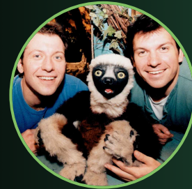
Kratt Brothers Zoboomafoo Hosts & Wildlife Influencers