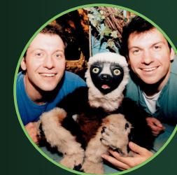
Kratt Brothers Hosts, Zoboofamu