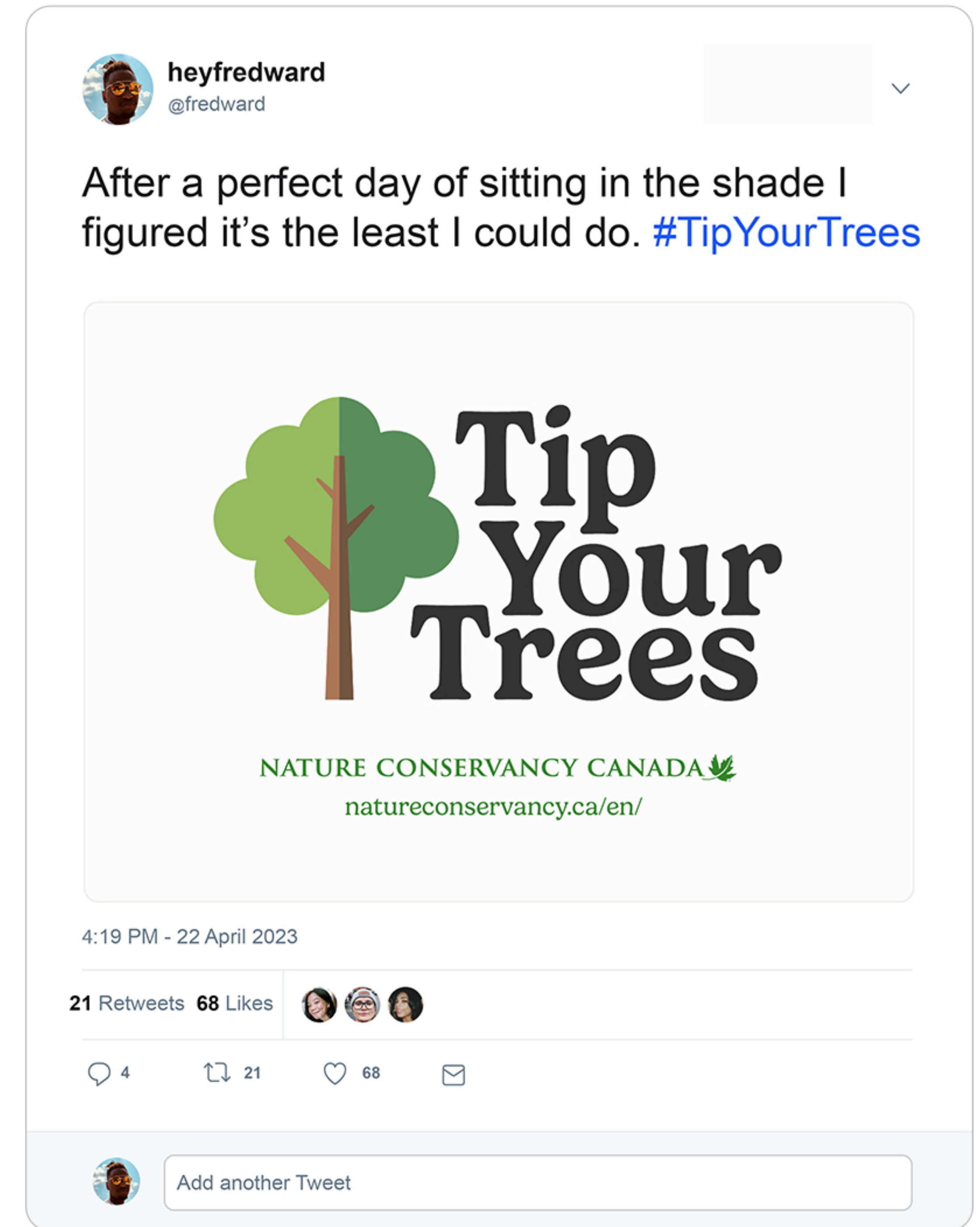
User generated content shared after submitting your tip online